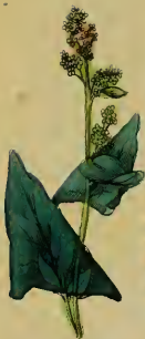
Good King Henry.